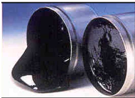
Fig. 9. Samples of asphalt binder.

explore the photooxidation of asphalt on leachability of asphalt.