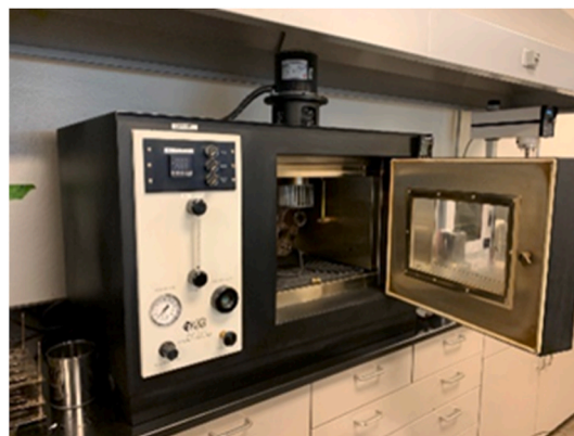
Fig. 7. Thin film oven aging.

This and the study by Xue et al. (2019) reported earlier are the first to