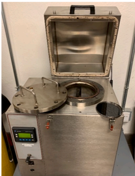
Fig. 8. Pressure aging vessel (PAV).