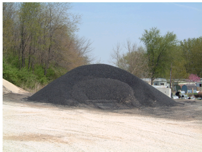
Fig. 5. Pile of reclaimed asphalt pavement (RAP).

The University of Florida conducted a comprehensive study of leaching characteristics of asphalt road waste assessing RAP from six stockpiles across Florida (Townsend and Brantley, 1998). Leachate samples were tested for volatiles, PAHs, and metals. Both TCLP and column (lysimeter) leaching were conducted. The TCLP leachate water