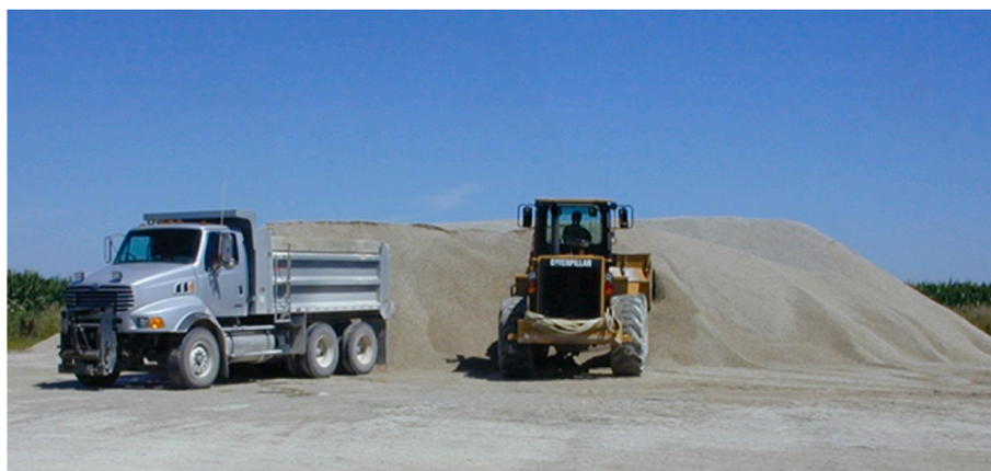
Fig. 6. Pile of recycled concrete aggregate (RCA).

Dynamic leaching of monolithic surface pavements in France were assessed using European CEN/TC 351 standardized tests (Paulus et al., 2016). An evaluation of diffusion of materials mixed with binders used