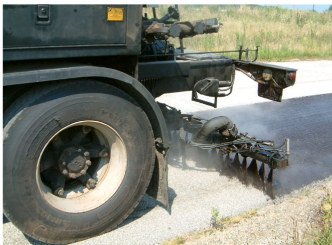
Fig. 2. Asphalt emulsion sprayed on the prepared road during chip seal process.

In New Zealand, concentrations in adjacent stream sediments were studied from coal tar and asphalt binders in street pavements to develop a concentration-weighted mixing model to apportion PAHs (Ahrens and Depree, 2010). Based on chemical differences between asphalt and coal tar, the likely sources of PAHs found in aquatic sediments were determined. The challenge is that both asphalt and coal tar look similar physically (viscous black binder) but are very different chemically. Coal tar is produced from pyrolysis tars generated from coal at high