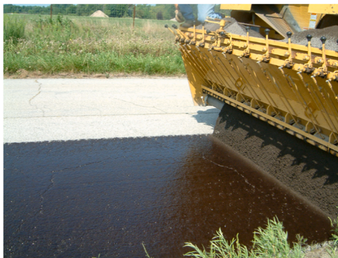
Fig. 3. Aggregate stone chips are spread on the freshly sprayed road.