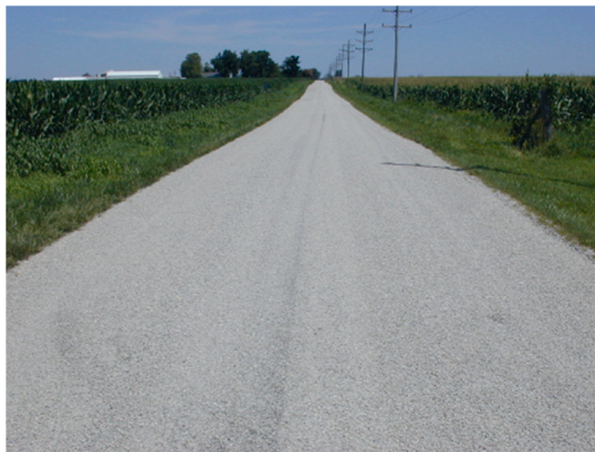
Fig. 4. Newly finished chip seal impervious roadway.

temperatures and has significant PAH concentrations. Asphalt binders are produced from the vacuum distillation of crude petroleum and have trace levels of PAHs. Through quantitative analysis of individual PAHs, Ahrens et al. demonstrated that coal tar is the principal source of aquatic PAH pollutants in New Zealand stormwater runoff from pavements.